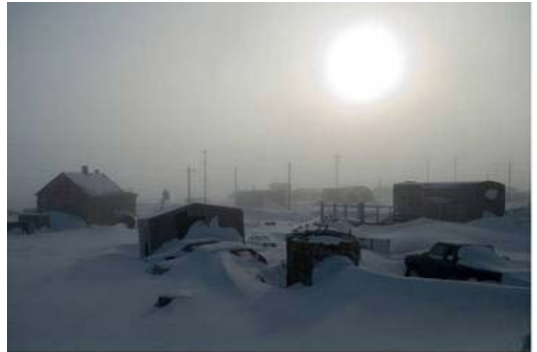
Kaktovik covered in snowdrifts after the storm

Explore other extreme events at uaf-accap.org/projects/extreme-events-library